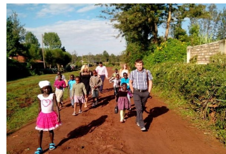
Sunday morning .

Summer is the time of vacation, heat, as a rule, good sunny weather for the inhabitants of the "white" continent of the Northern hemisphere. For Kenya three months of summer is the time of cold weather, rain, a peak of cyclic annual epidemics of malaria and typhoid. It is the period when the raincoat and boots during the day and a mosquito net and a warm blanket at night are particularly relevant. For the missionary team this is the time of increased readiness: more work, more care about sick children, more vigilance not to get sick ourselves.